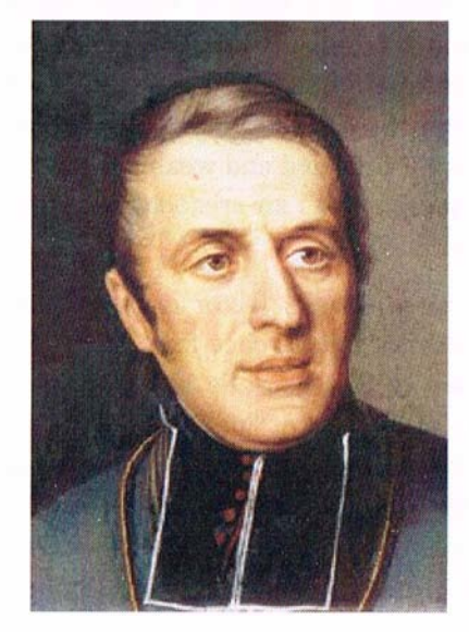
August 1, 1782- May 21, 1861

Christ the King Retreat Center 621 First Avenue South Buffalo, MN 55313 www.kingshouse.com